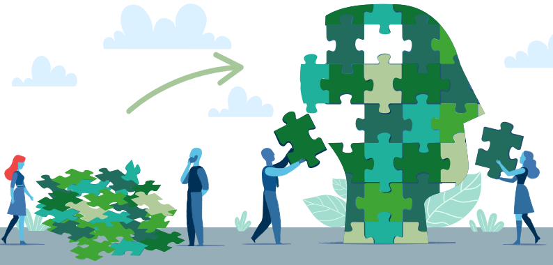
Caption: Separate but Together

Relational practice: a move from separated, fragmented service models focused on costs and problems to united, connected services that embrace each person as a whole.